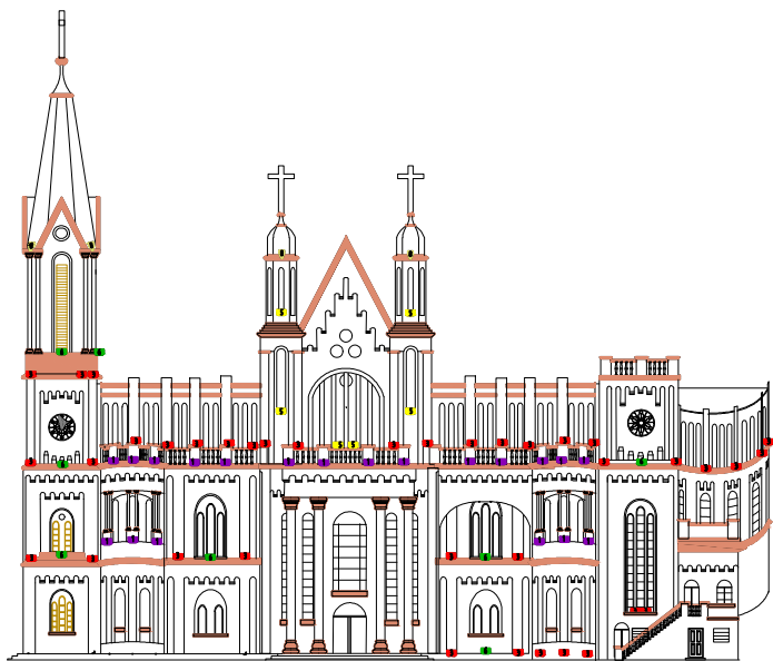
FACHADA LATERAL DIREITA